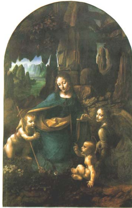
The Second Virgin of the Rocks